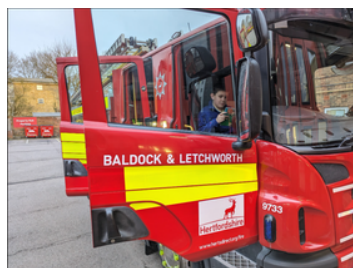
Oliver - Hawthorn