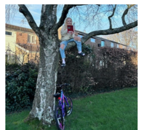
Lottie - Pear