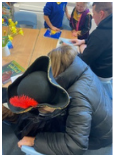
Read along with parents