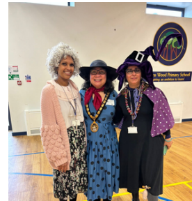
Our children and staff