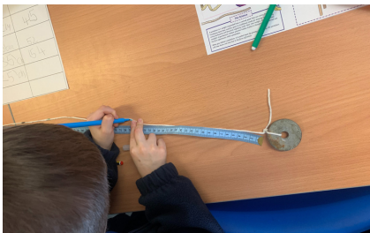
Year 3 working engineering with pendulums