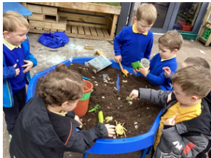
Early years plants and Mini Beasts