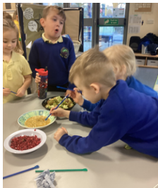
Reception tasting and painting fruit