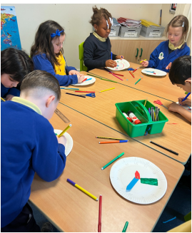
Year 2 time hunt and clock making