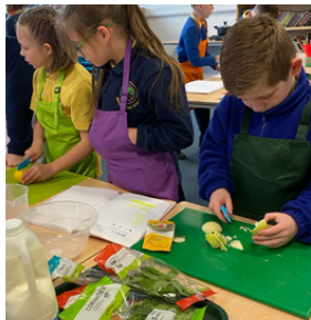
Year 5 preparing, cooking and eating soup