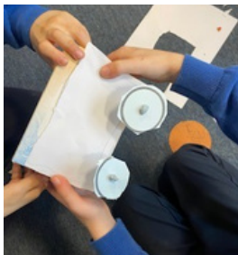
Year 1 designing cars and making towers