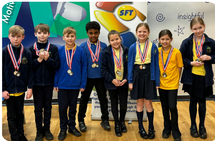
2nd -The team of 8 relay