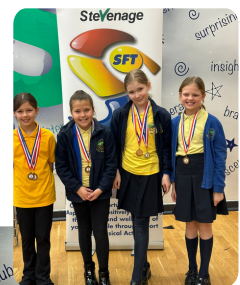
3rd -Girls relay