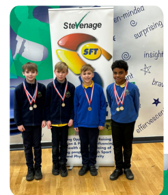
1st - Boys Relay