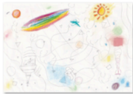
White - Rainbow and Sun and Sky ENLARGE

Maximus UK are delighted to share that, due to the fantastic response to their Fussy Eating Masterclass, they will be running it again on Thursday, 6th March 2025, from 6-7 pm. Please see the attached leaflet for more details!