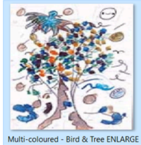
Multi-coloured - Bird & Tree ENLARGE