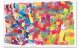
Multi-coloured - Coloured patches ENLARGE (check orientation)