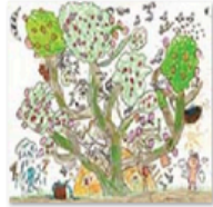
Green - Tree & Characters ENLARGE