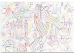
White - Bright cityscape ENLARGE