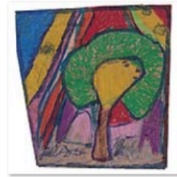
Multi-coloured - Character Tree and Lines ENLARGE