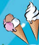
Ice cream van