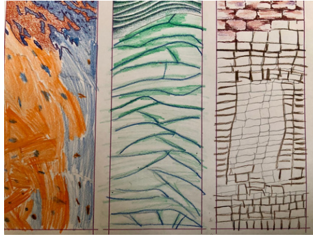
Some students had been exploring visual textures