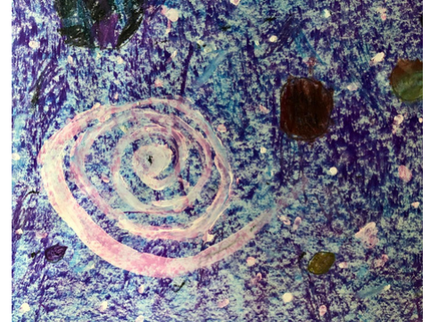
Exploring Mixed media of "false print" techniques