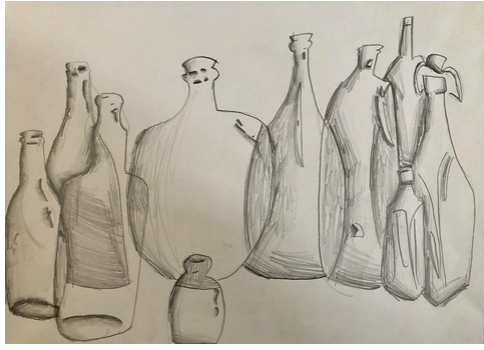
Sample of academic drawing, using clean lines and minimalist reflection