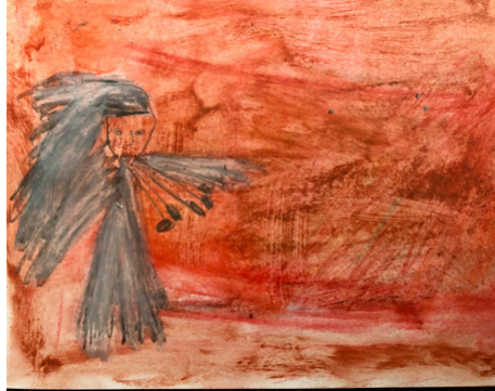
This piece explore conceptual archetype of the music