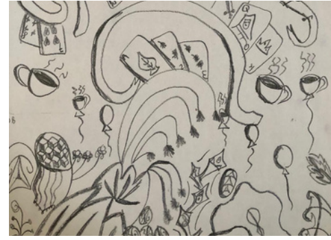
Other students had been working on book inspired illustrations