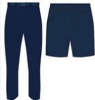
Plain navy trousers or shorts