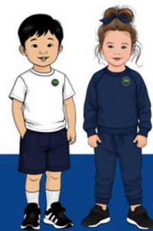
White, grey or black socks